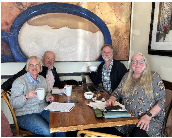
With some writer friends at Seattle Coffee House

From Yemen, coffee spread throughout the Middle East and Mediterranean. Beginning in the late seventeenth century, coffee plants were taken to Java, and then Brazil, Colombia, and other fortunate lands, and soon after that the symbiosis between coffee and humans extended around the world.